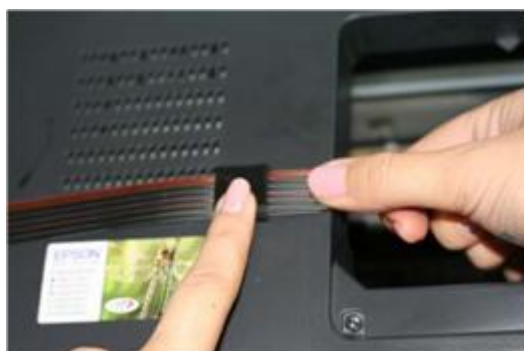
Pic. 3-8-1 Pic.

Press sticker, then lengthen it (3-8-1) or shorten it (3-8-2), redo step 8 to adjust tube to right lengthen.